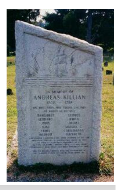
Monument located at Old Saint Paul's Lutheran Church about two miles West of Newton, North Carolina